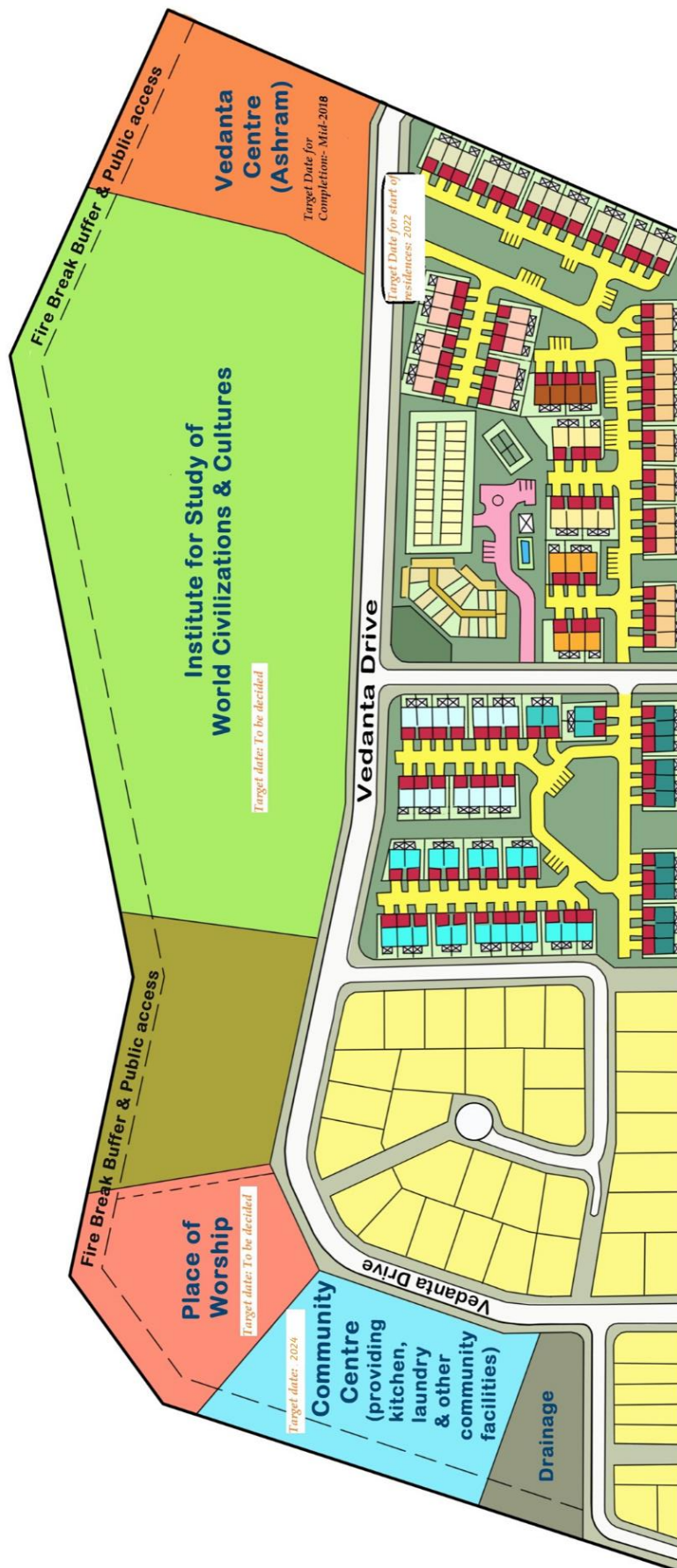
Proposed Master Plan for the Vedanta Precinct, Springfield Lakes, Queensland