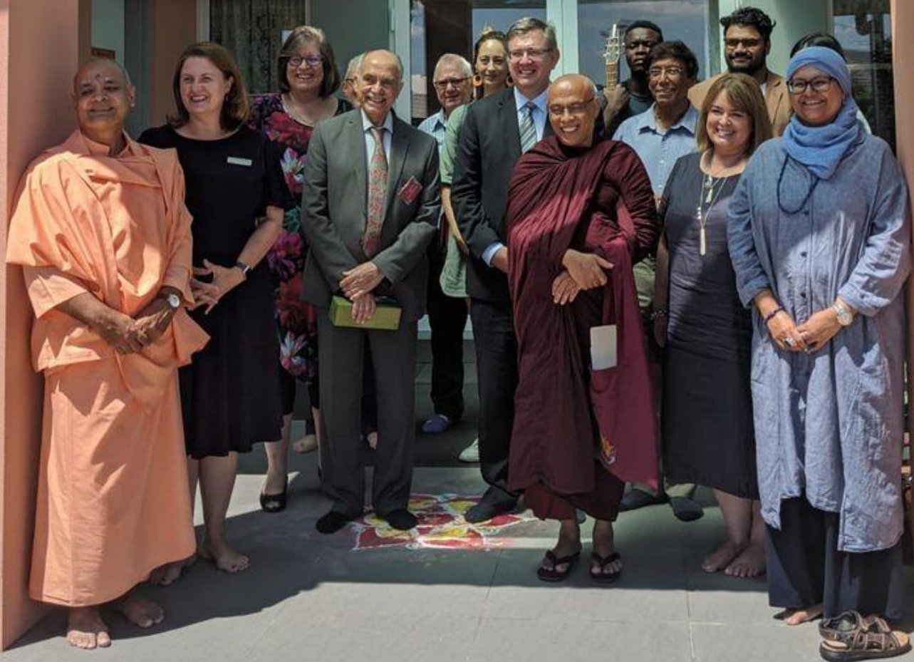
Attendees of Multifaith Program, March 2020